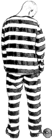
Payday for sin is often on another day!

Wrong! No one gets away with any sin. Lightning may not strike the child when he lied to his parent. A teenager may not have been thrown into jail when he did not get caught damaging another's property. One's short drinking binge did not land him in a rehab. A husband's peeking at pornography on the internet was not observed by his wife.