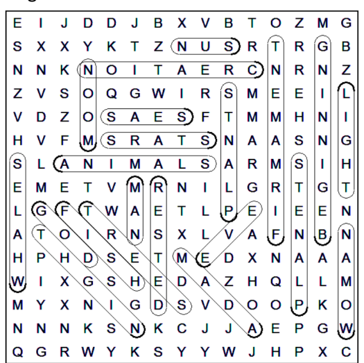
Page 10: Creation